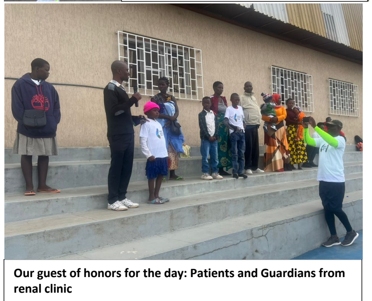
Our guest of honors for the day: Patients and Guardians from renal clinic