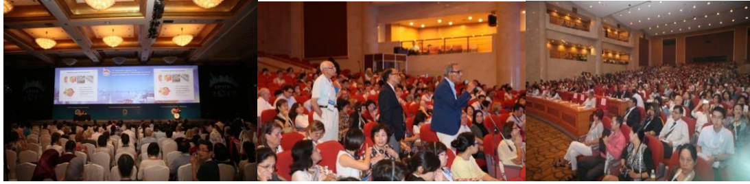
The Sixteenth Congress of the International Pediatric Nephrology Association (2013, Shanghai, China), 1229 attendees from 79 countries/regions.