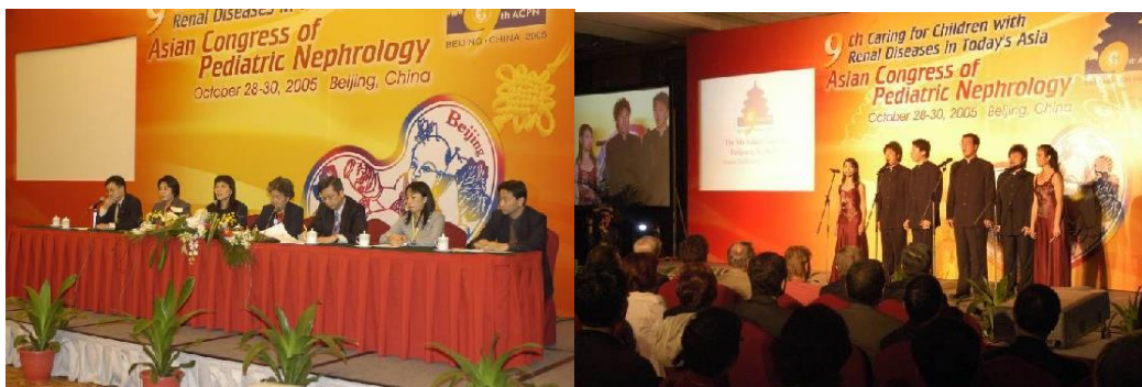
The 9 th Asian Pediatric Nephrology Congress, Beijing, 2005.