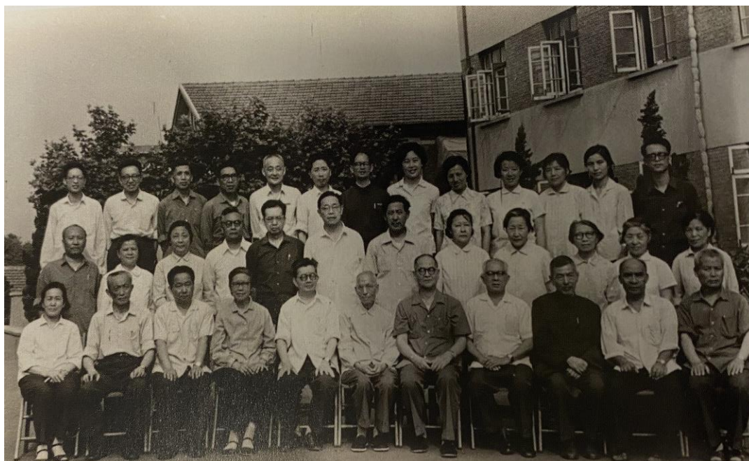
The first meeting of Chinese Pediatric Nephrology Working Group in Nanjing Medical College in 1979.