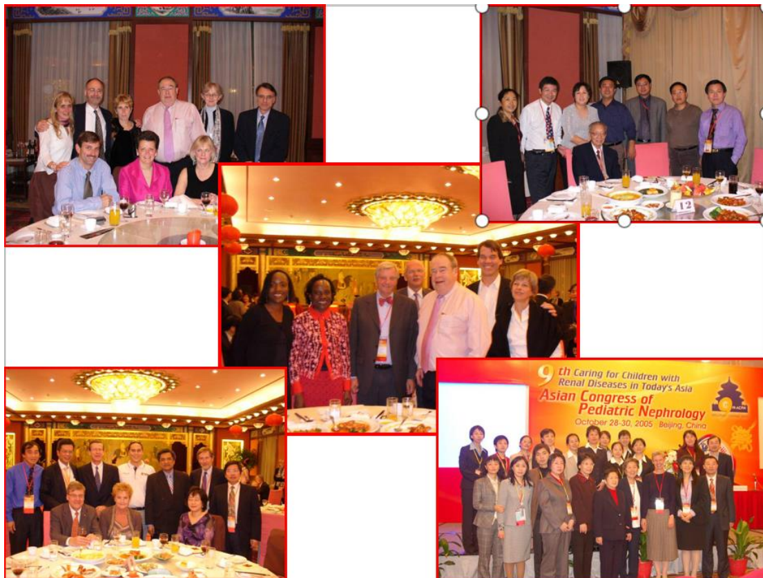
The 9 th Asian Pediatric Nephrology Congress, Beijing, 2005. 第九届亚洲儿科肾脏病大会（北京，2005）