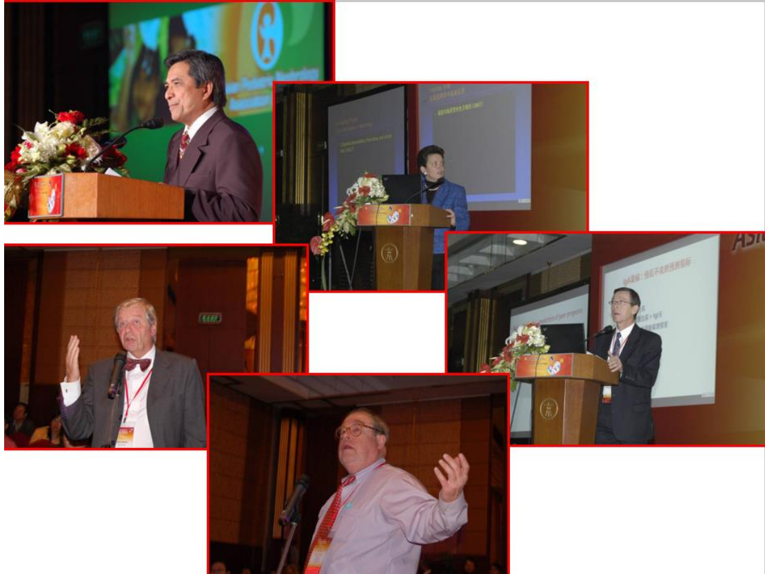
The 9 th Asian Pediatric Nephrology Congress, Beijing, 2005. 第九届亚洲儿科肾脏病大会（北京，2005）