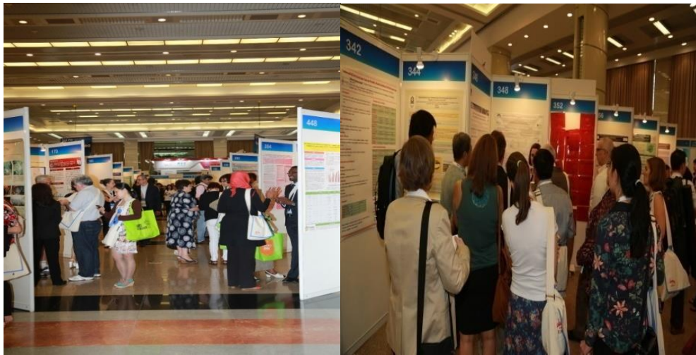
The Sixteenth Congress of the International Pediatric Nephrology Association (2013, Shanghai, China), Scientific Abstracts.