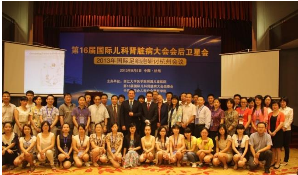
The Sixteenth Congress of the International Pediatric Nephrology Association (2013, Shanghai, China), IPNA2013 has significant impact on pediatric nephrology in China. "Five-City Satellite Meeting in China" Post-Congress Program ( Beijing, Nanjing, Changsha, Chongqing & Hangzhou, total 402 attendees)