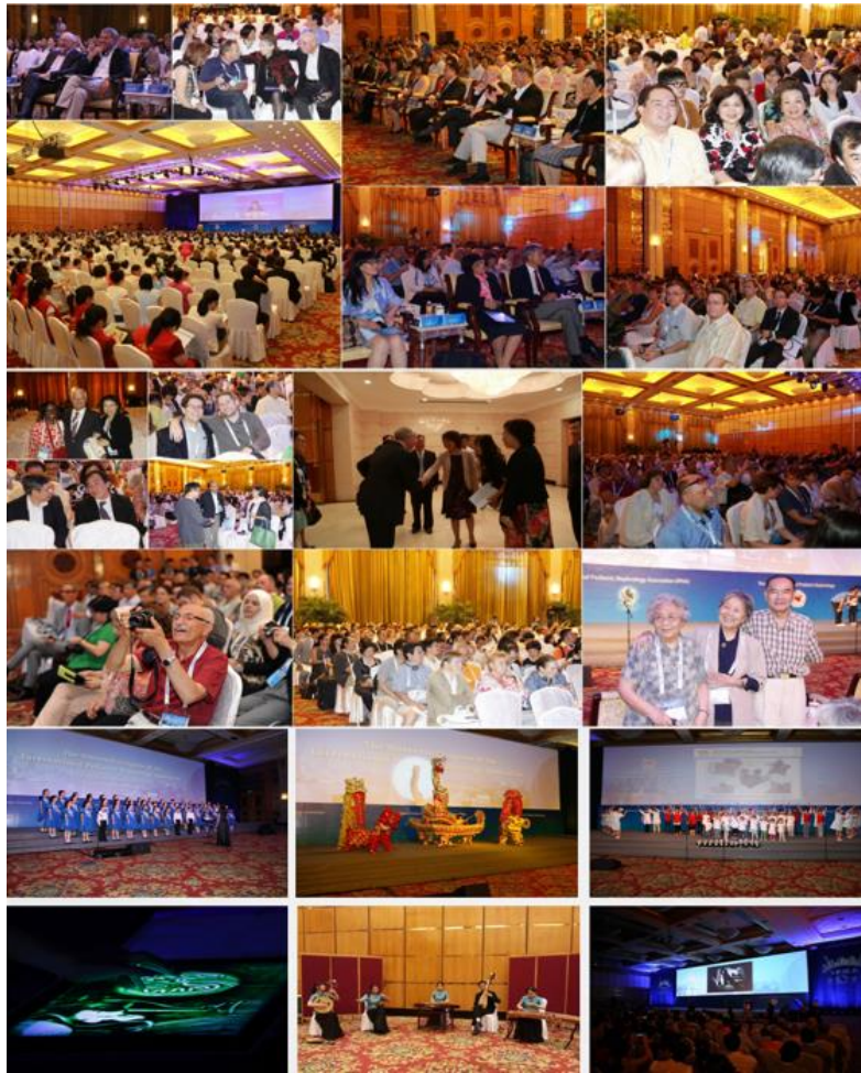
The Sixteenth Congress of the International Pediatric Nephrology Association (2013, Shanghai, China), Opening Ceremony & Welcome Reception.