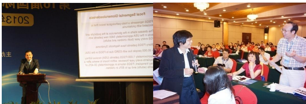
The Sixteenth Congress of the International Pediatric Nephrology Association (2013, Shanghai, China), IPNA 2013 has significant impact on pediatric nephrology in China. "Five-City Satellite Meeting in China" Post-Congress Program (Beijing, Nanjing, Changsha, Chongqing & Hangzhou, total 402 attendees)