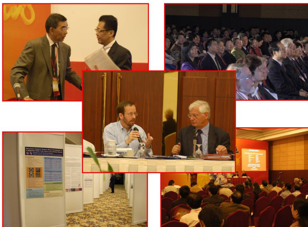
The 9 th Asian Pediatric Nephrology Congress, Beijing, 2005.