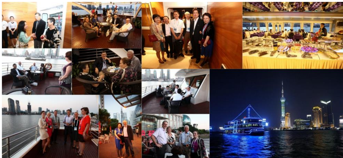
The Sixteenth Congress of the International Pediatric Nephrology Association (2013, Shanghai, China), Faculty Huangpu River Cruise-2 boats and 325 attendees.