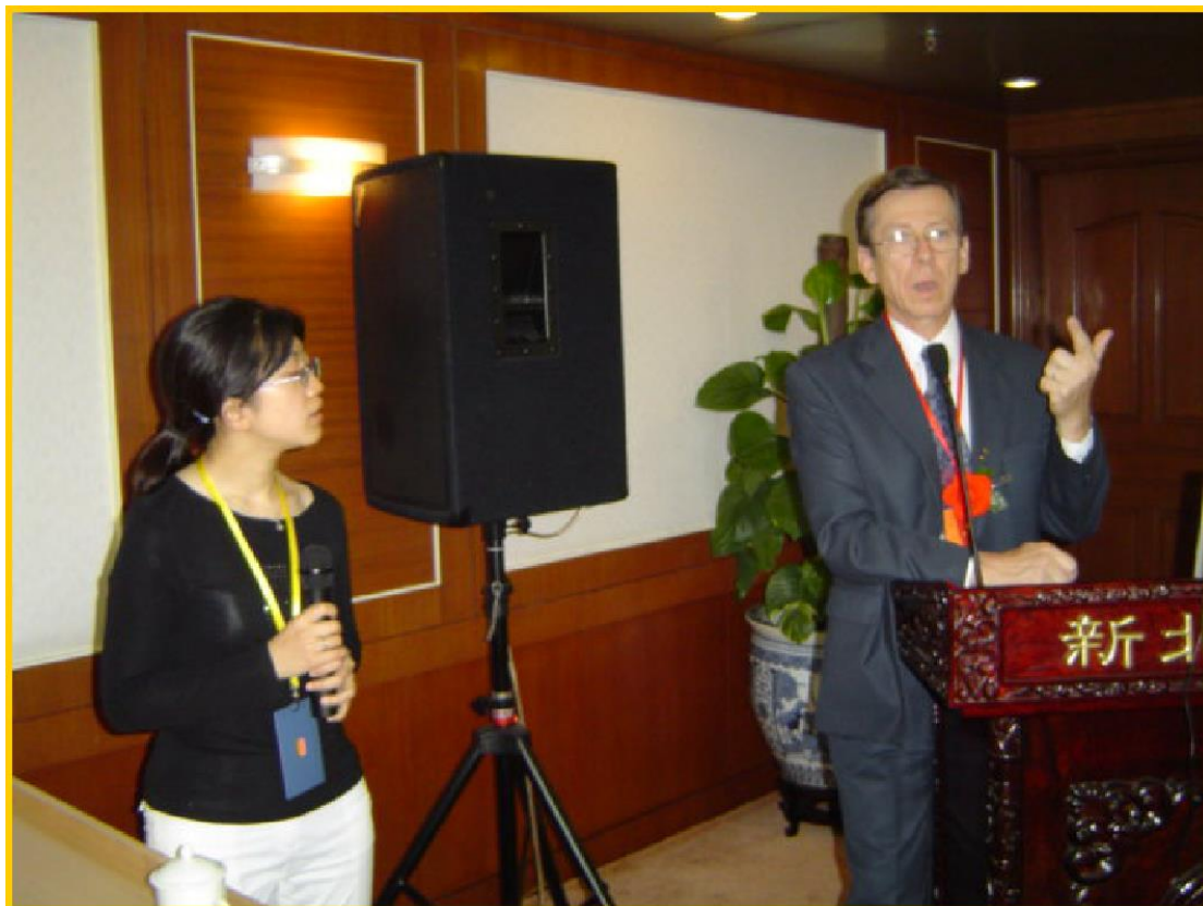
The First IPNA Training Course in China and the 15th National Course of Pediatric Nephrology,

首届 IPNA 国际儿科肾脏病研讨会暨第 15 届全国儿肾学习班（Masataka Honda 教授，日本），北京，2004 年