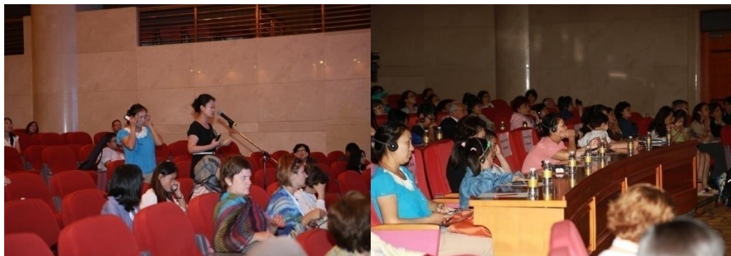
The Sixteenth Congress of the International Pediatric Nephrology Association (2013, Shanghai, China) ,IPNA2013 has significant impact on pediatric nephrology in China. Renal Kids and their parents from China attended the international congress personally.